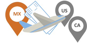
Weekly YoY % variation in net bookings for MX to the U.S and Canada.